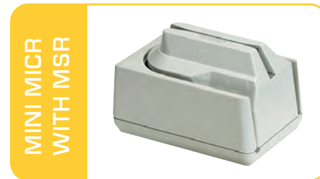
MINI MICR WITH MSR