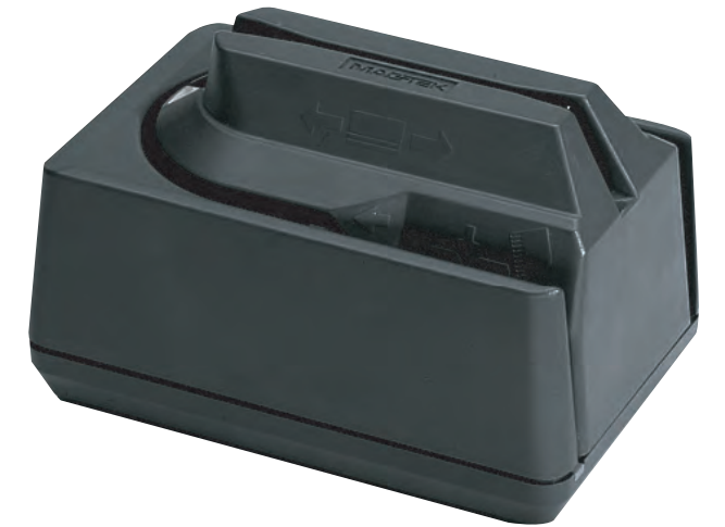
Mini MICR with MSR