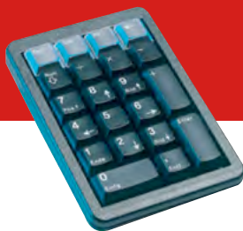
G84-4700 PRB (1)